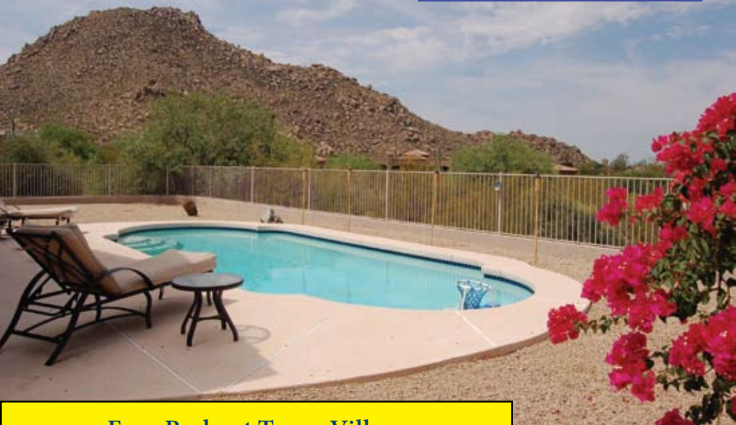
Four Peaks at Troon Village